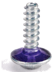
M3 BEFORE INSTALLATIONS