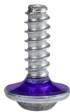
AFTER 5X INSTALLATIONS / REMOVALS